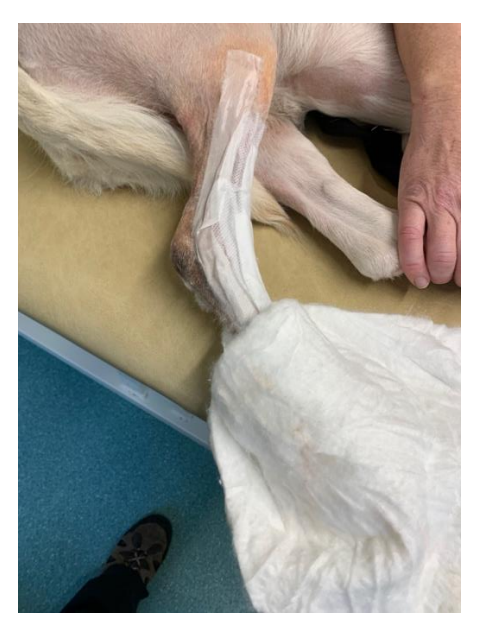
Now simply unwind the Sof Band layer and the second K Band layers and then the underlying Cotton Wool layer to expose the wound covered with a Primapore and the tape stirrups