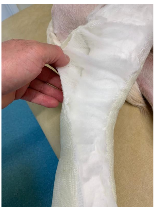
Using curved bandage scissors carefully cut the underlying K band layer so that the K band and Soft Cast layers can be removed as one.