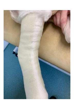
First simply unwind the outer Vet Wrap layer to expose the underlying Soft Cast layer with the cut along the dorsal surface. The Soft Cast will have adhered to the K Band.