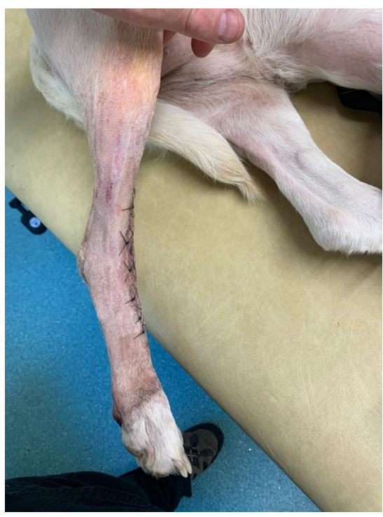
Finally using either spirit or preferably "Ease Off" remove the stirrups and Primapore to expose the healing wound and stitches.